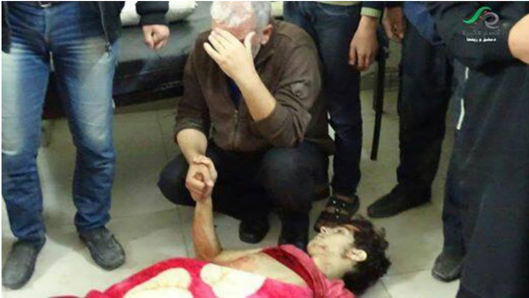
Image of one of the child victims

DAMASCUS CENTER FOR HUMAN RIGHTS STUDIES