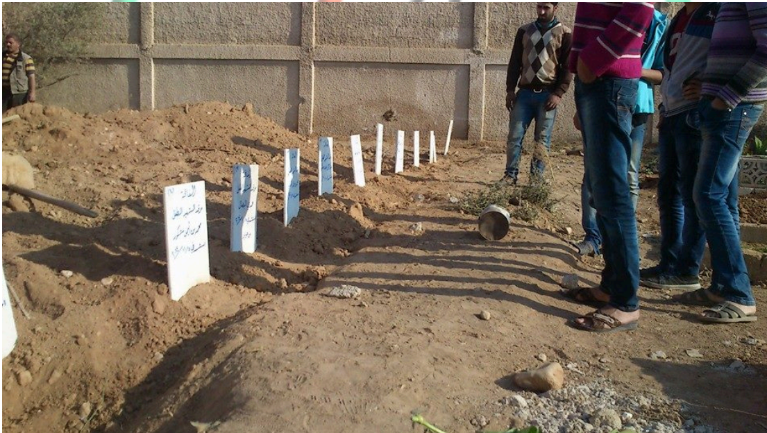
Mass grave for the children victims

Damascus Center for Human Rights Studies | 1025 Connecticut Ave NW | Suite 1000