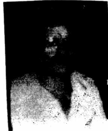
'Abd al-Majid al-Maghribi